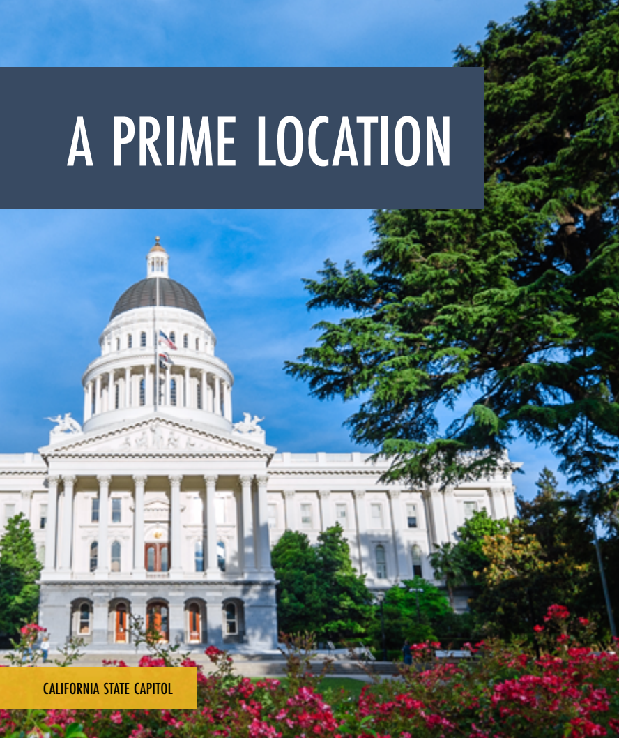
CALIFORNIA STATE CAPITOL